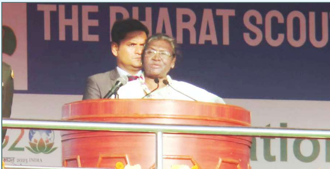
SMT. DROUPADI MURMU HON'BLE PRESIDENT OF INDIA