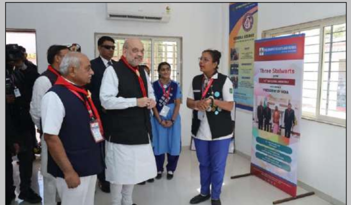
Shri Amit Shah, Hon'ble Union Home Minister inaugurated the newly constructed training and residential building of Bharat Scouts and Guides, Gujarat State.